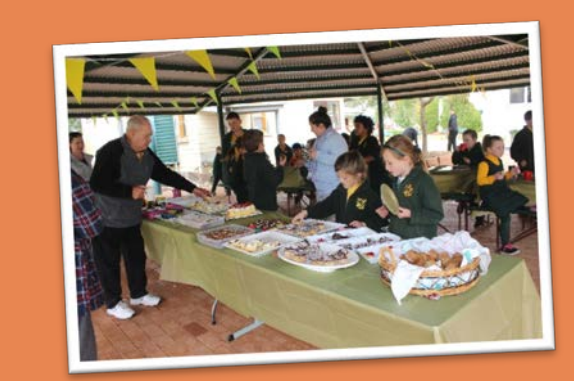
Our community morning tea raising funds for the Cancer Council