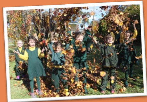
Year 2 enjoying our front garden