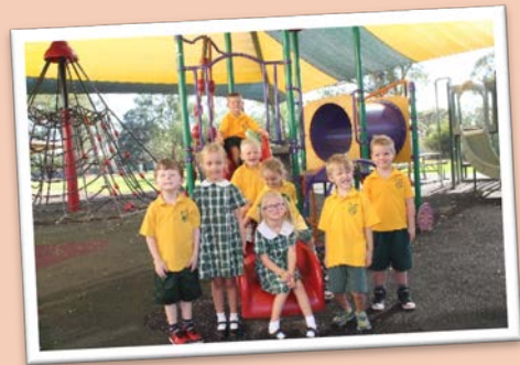
Our Kindergarten class of 2019!