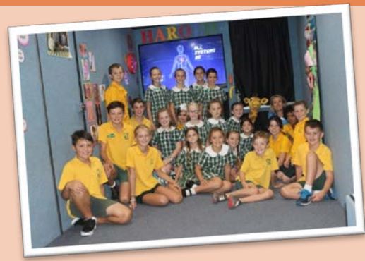
Years 3-6 during their visit to the Life Education Van