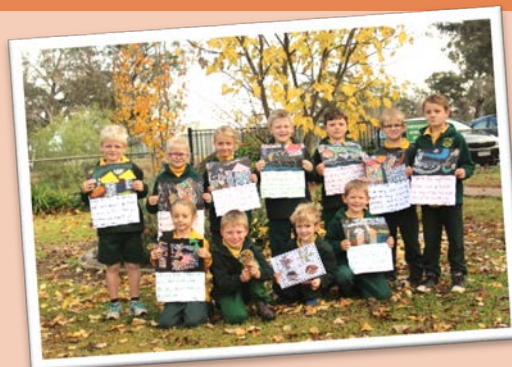
K-2 with their masterpieces!