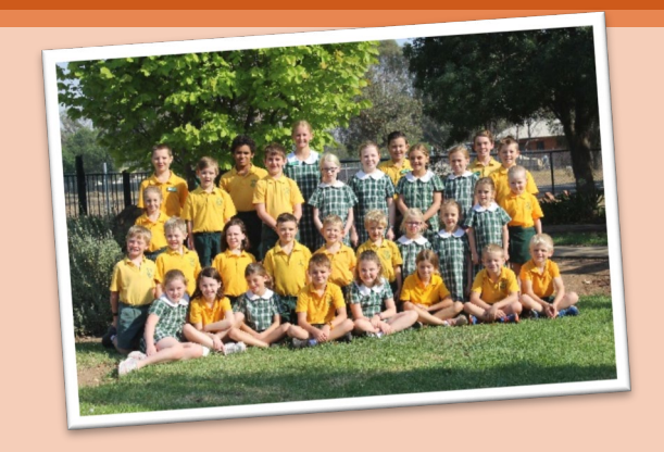
Kindergarten to Year 6 - 4/02/2020