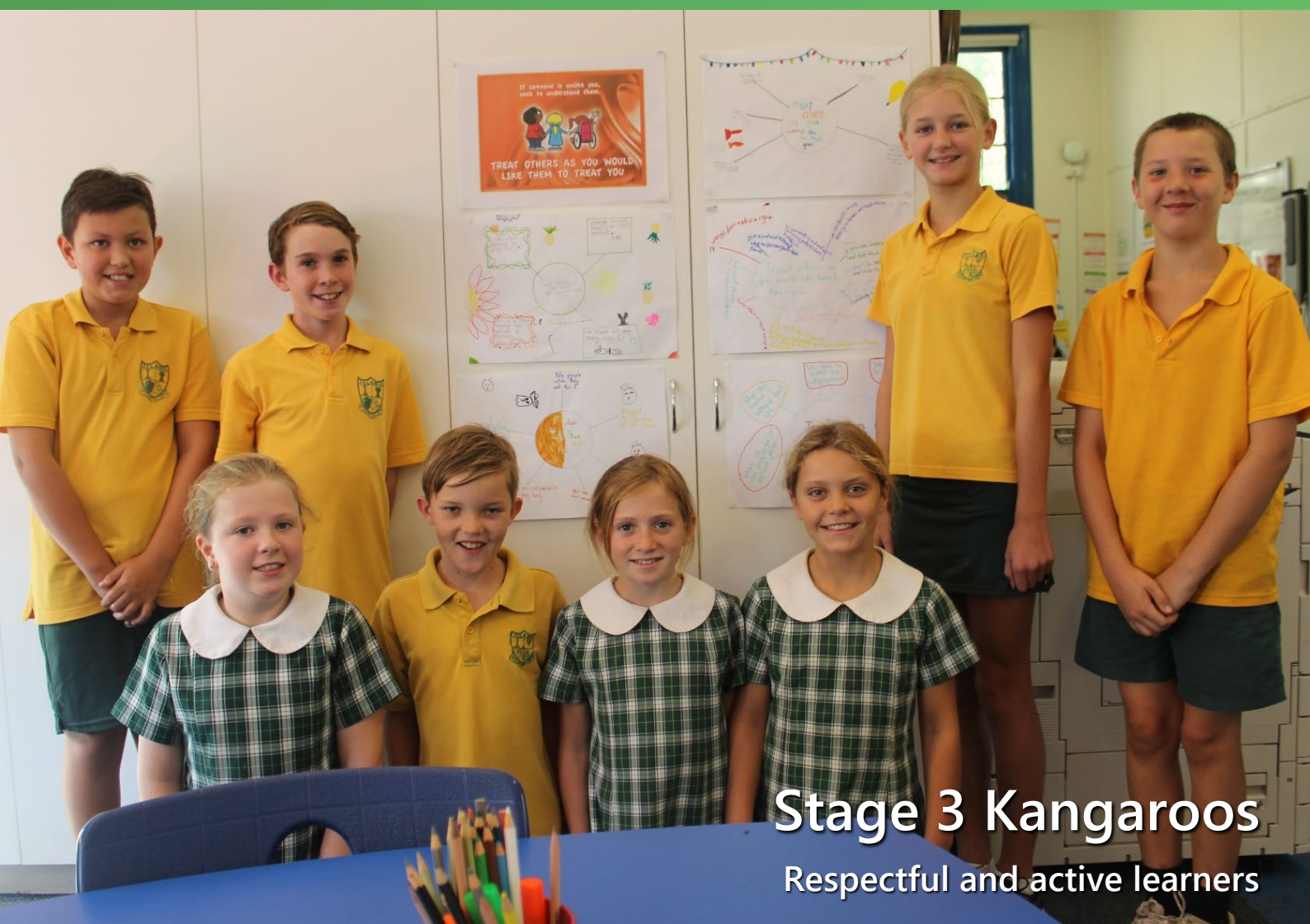
Stage 3 Kangaroos Respectful and active learners